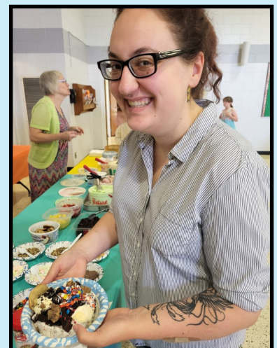
Everybody loves Sundae Sunday! (some more than others...)