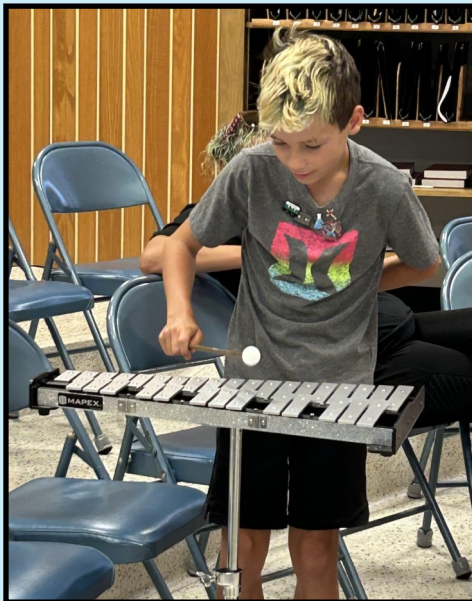
A few shots from a recent jam session