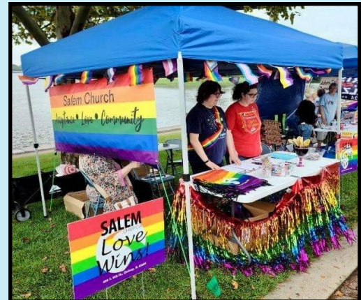
Salem’s booth at Pride in the Park—thanks to all who volunteered to staff it!